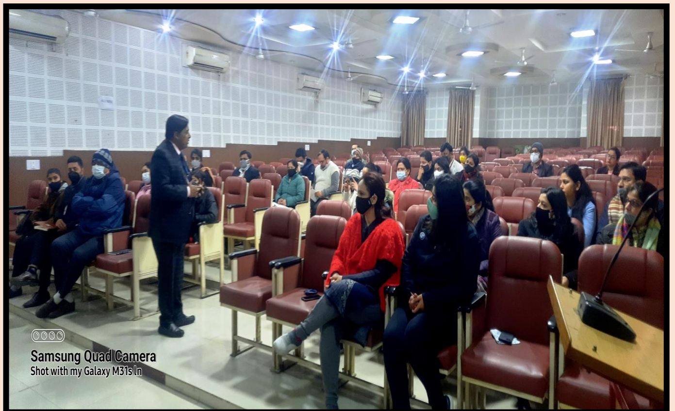
Question Answer session on the second day of workshop